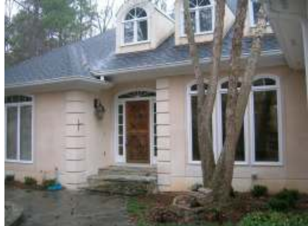
Fungal Contamination due to high air moisture