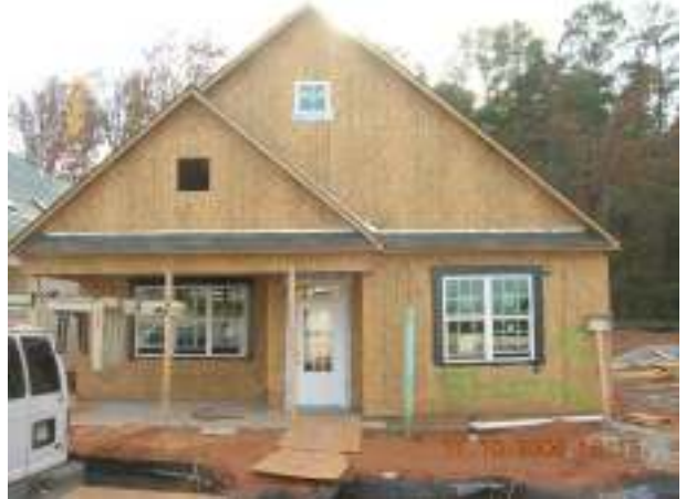
Fungal Contamination due to high air moisture

Investigation – Moisture & Bio-growth Issues Remediation Protocol Chemical Remediation Inhibitor Application Inhibitor Documentation